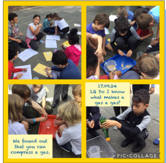
Year 4 Science outdoors

The good weather has meant that we have been able to take the learning outside and lots of classes have enjoyed using our beautiful grounds for their lessons.