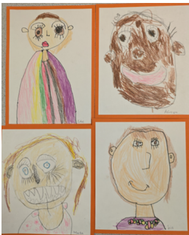
Beautiful portraits from Reception.